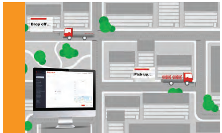
Optimises administration & visibility of assets

By upgrading to Loscam Online V6, we aim to expand the features of the current platform, improve operational efficiency and proactively provide 7/24 customer support. The upgraded system has a more user-friendly system, allowing customers to access invoices and statements, account balances, transactions, copies of dockets and account analysis graphs and data more easily.