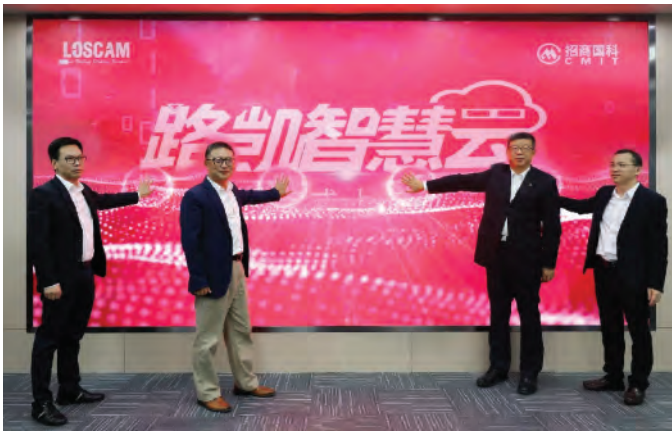
LOSCAM Online+ launch ceremony