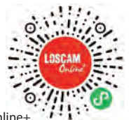
LOSCAM Online+ in WeChat Mini programs

Loscam's new platform serves not only as a key part of digitalizing its business and customer service, but is another successful example of CMIT's business innovation. Taking into account the rapid growth of China's palletized transportation process and Loscam's own business growth, Loscam and CMIT will continue to collaborate to further develop LOSCAM Online+ and maintain Loscam's customer experience to play a key role in promoting large-scale palletized transportation in China.