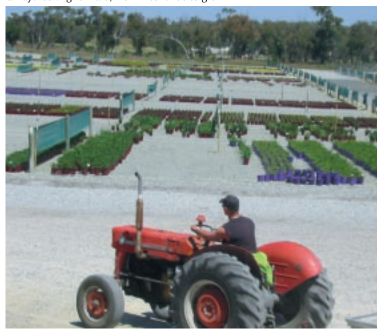
Benara Nursery covers 300 acres and employs 400.

"Because we are currently across such a broad range," Rod says, "and we are always looking forward, we will continue to grow."